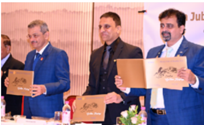
Unveiling of Golden Musings