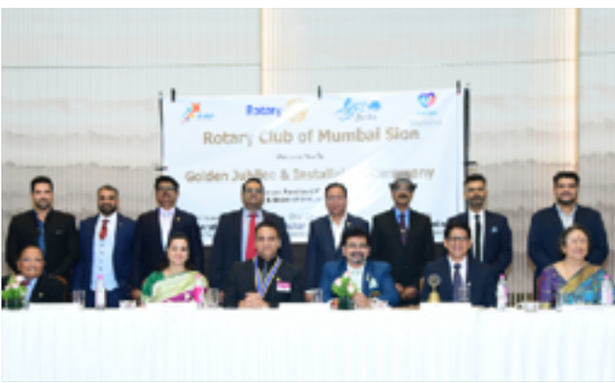
Rotary Sion BOD. RY. 2024 - 25