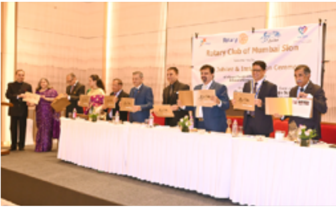
Golden Musing - Souvenir Book Unveiled