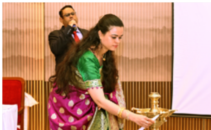
First Lady Swati & PE. Yogesh Prabhu